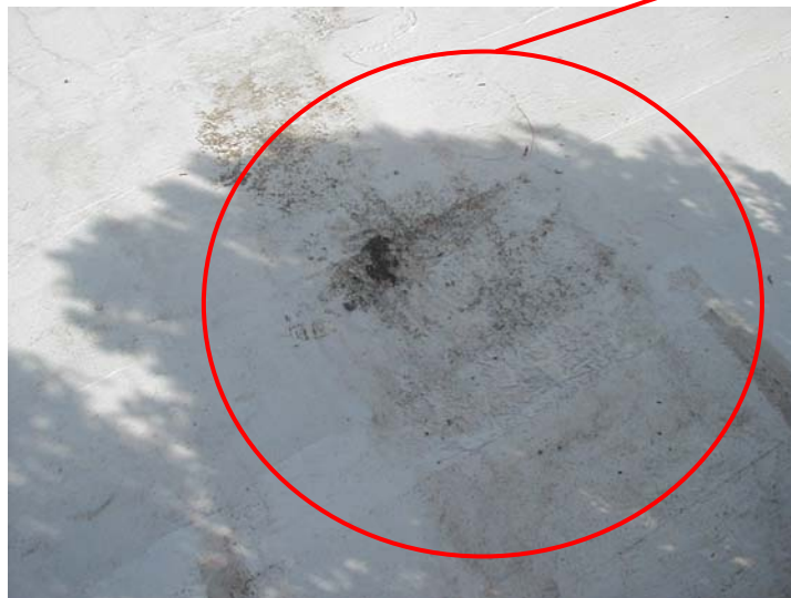
RC.1 Surface Coating Needed